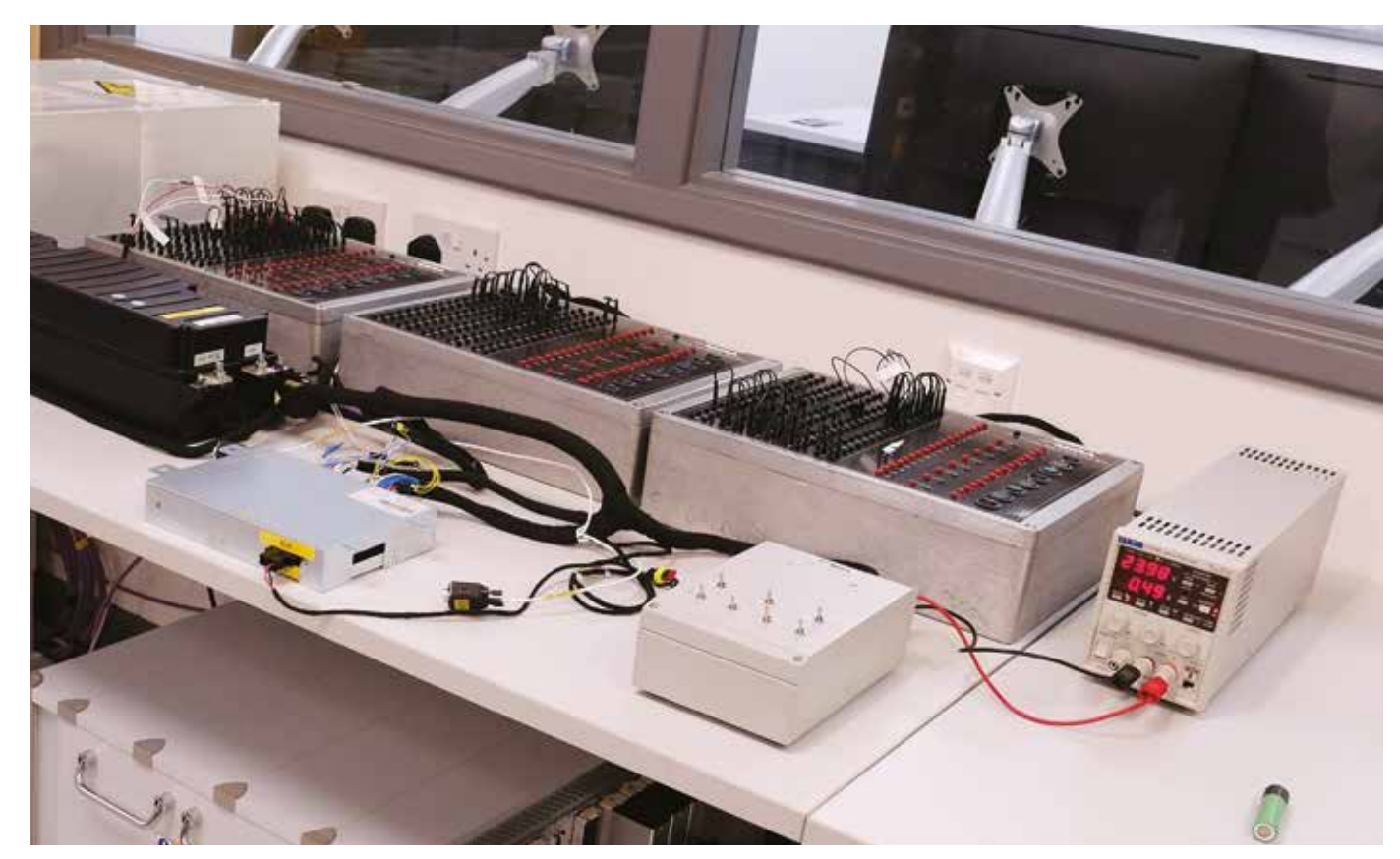
Part of the ABDS suite

management, including the ability to pre-condition the packs to an optimised temperature.